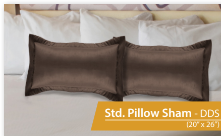
Std. Pillow Sham - DDS (20" x 26")