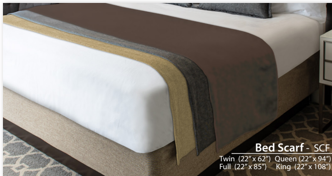
Bed Scarf - SCF Twin (22" x 62") Queen (22" x 94") Full (22" x 85") King (22" x 108")