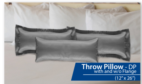
Throw Pillow - DP with and w/o Flange (12" x 26")

The Designer Décor® Collection offers matching accessories for repetition of color to complete your bedding ensemble. Pillow coverings are removable for easy laundering.