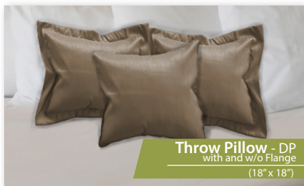
Throw Pillow - DP with and w/o Flange (18" x 18")