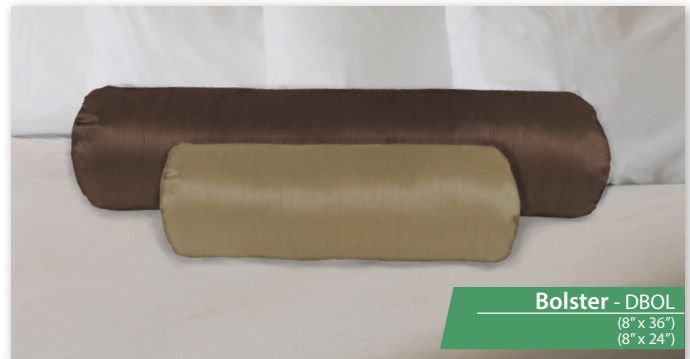
Bolster - DBOL (8" x 36") (8" x 24")