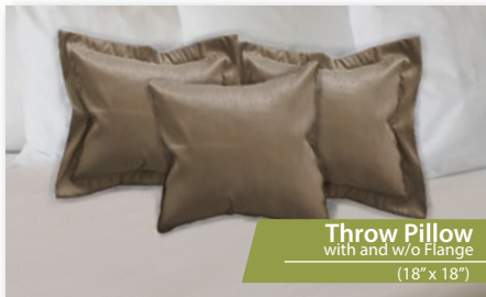
Throw Pillow with and w/o Flange (18" x 18")