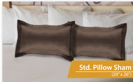
Std. Pillow Sham (20" x 26")