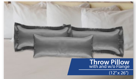
Throw Pillow with and w/o Flange (12" x 26")

The Designer Décor™ Collection offers matching accessories for repetition of color to complete your bedding ensemble. Pillow coverings are removable for easy laundering.